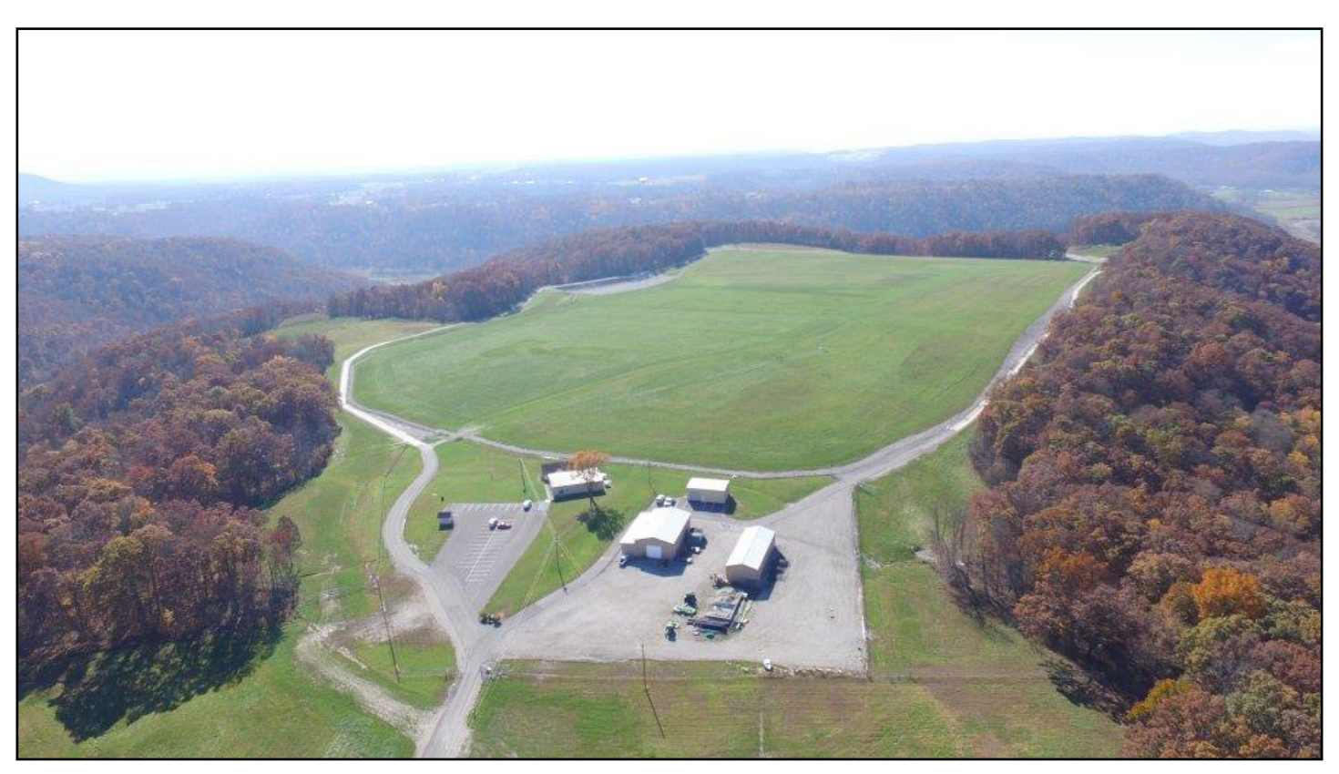
2017 Aerial View of the Maxey Flats Disposal Site; Substantial Completion of the Final Cap Was Achieved in November 2016

has been estimated to contain about 2.4 million curies of byproduct material (material that became radioactive by neutron activation in nuclear reactors), about 553,000 pounds of source material, 950 pounds of special nuclear material (plutonium, uranium-233, or uranium enriched in the isotopes uranium-233, or uranium-235), and more than 140 pounds of plutonium.